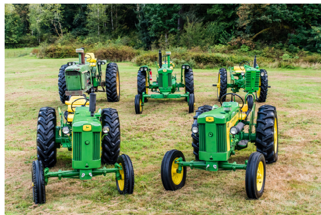
1961 JD 4010d, 1959 JD 530w, 1951 JD MT, 1960 JD 430u orchard exhaust & 1960 JD 430u